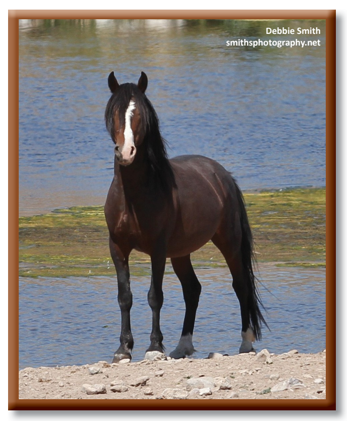
Later taken over by Paladin.