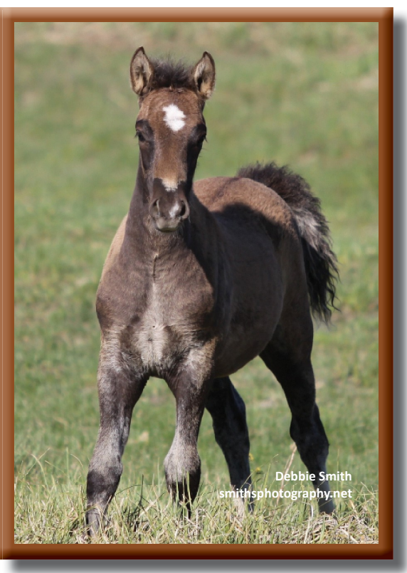
Studley's Colt Rio