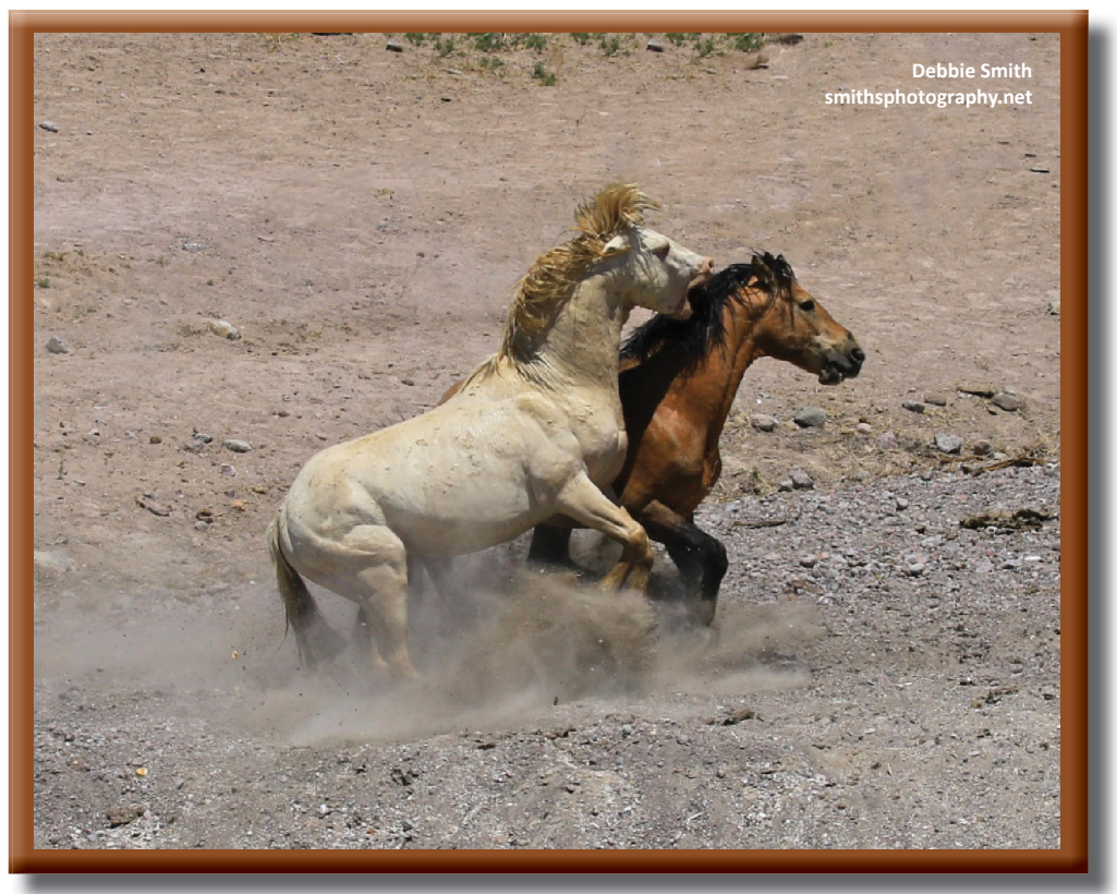
Ghost and Chetan