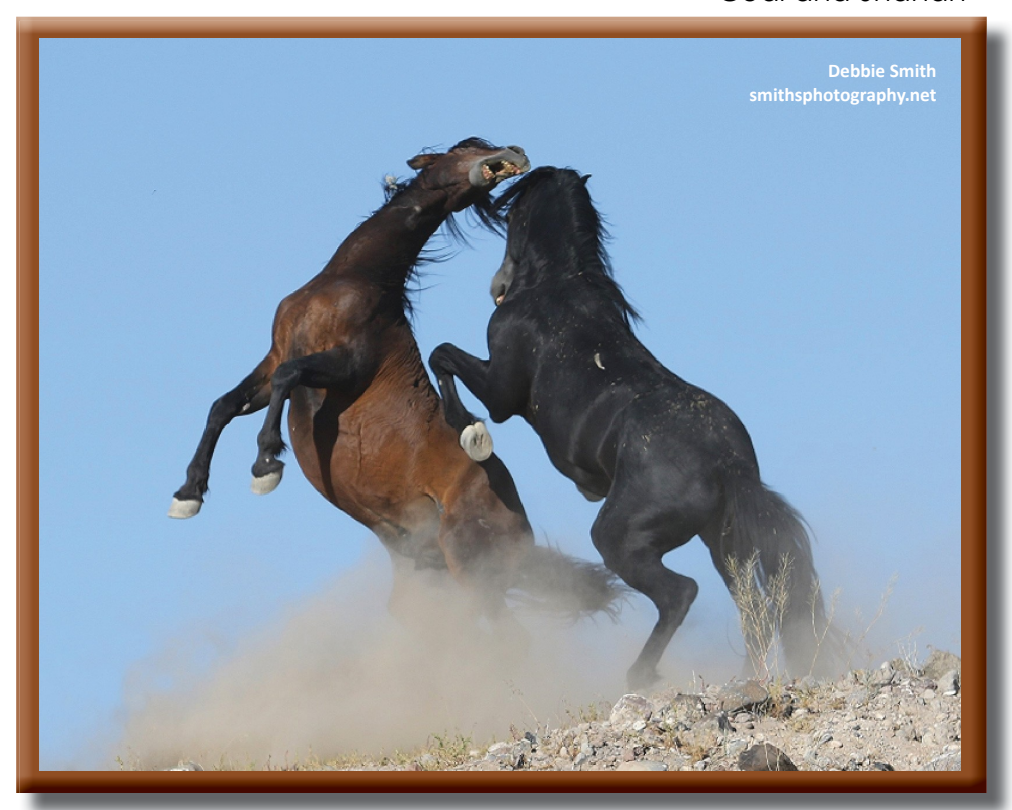
Granada and Coal