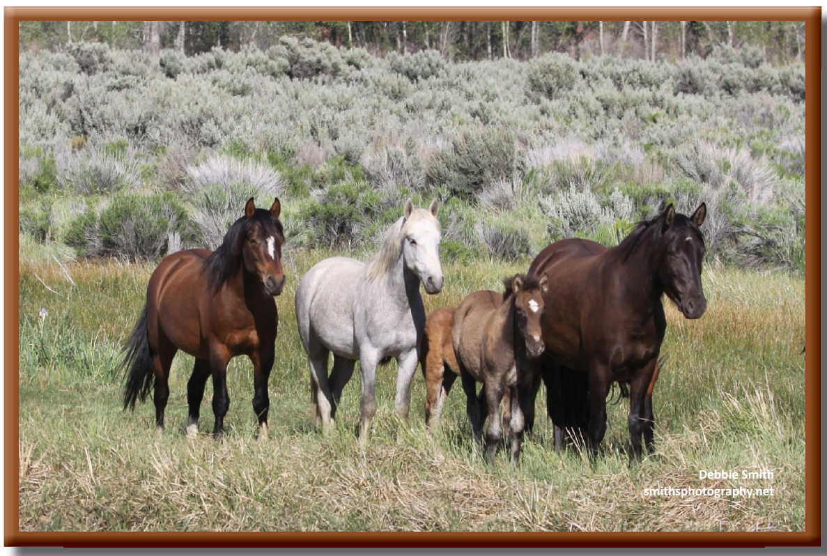
Studley,Running Sage, Rio and Coco