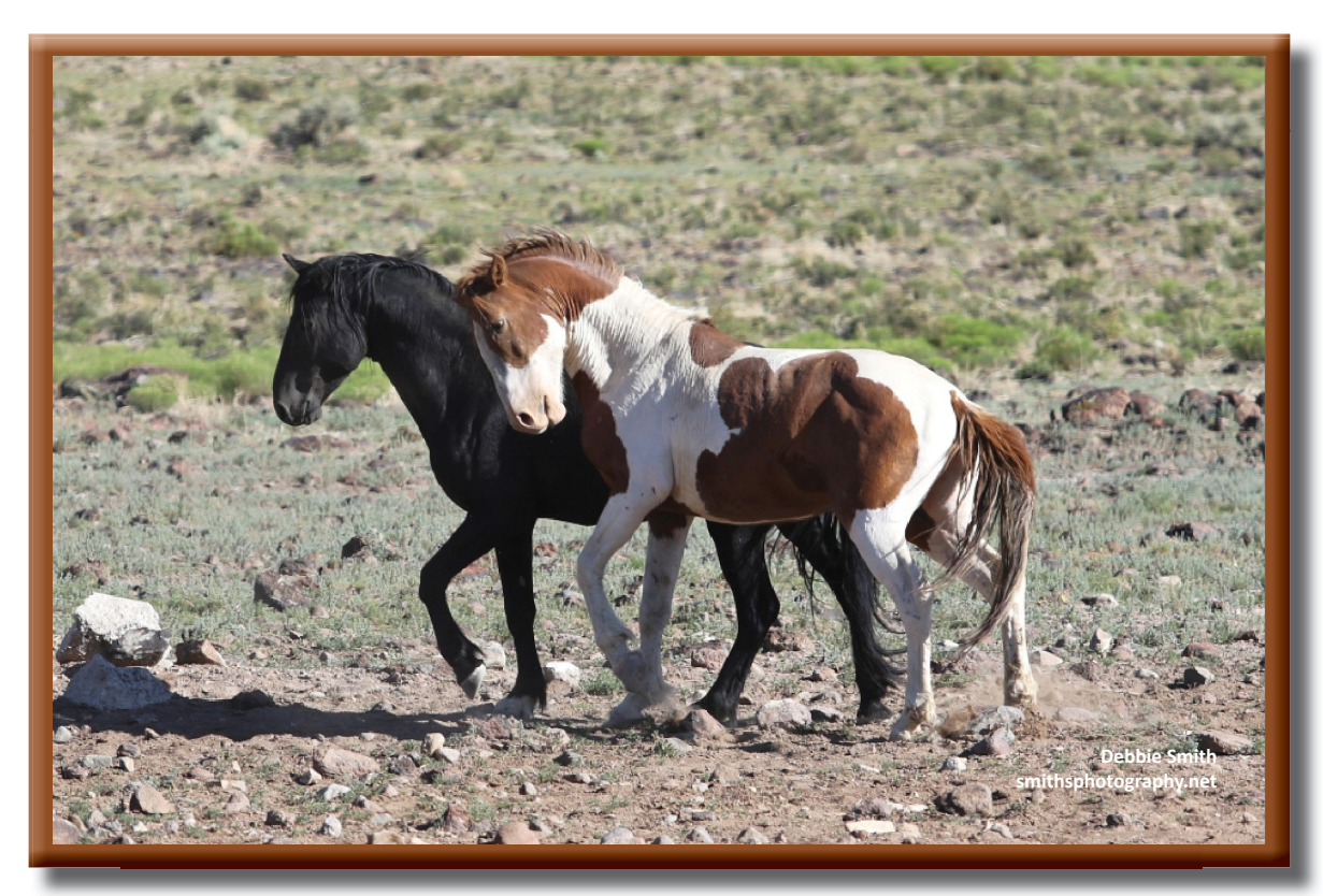
Coal and Shanan