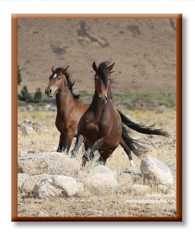
Virginia Range Bachelors