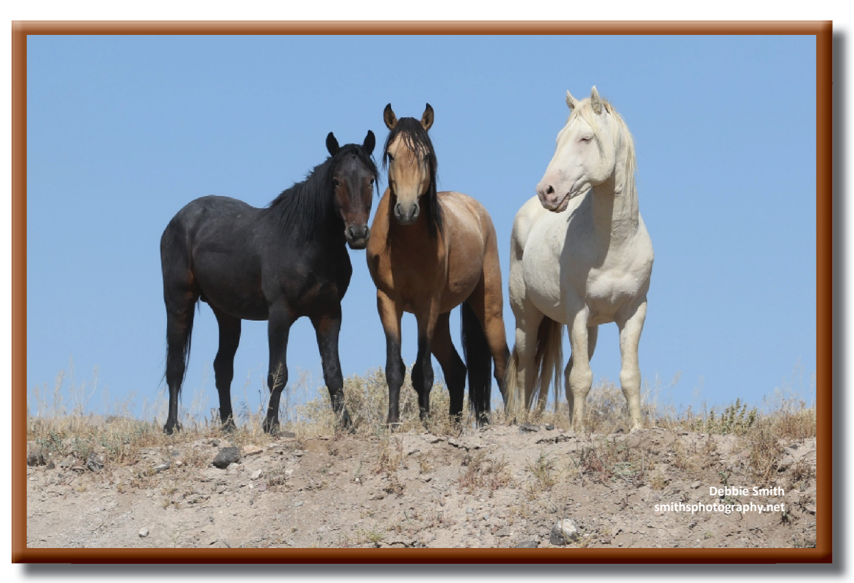
Ghost and Two Bachelors