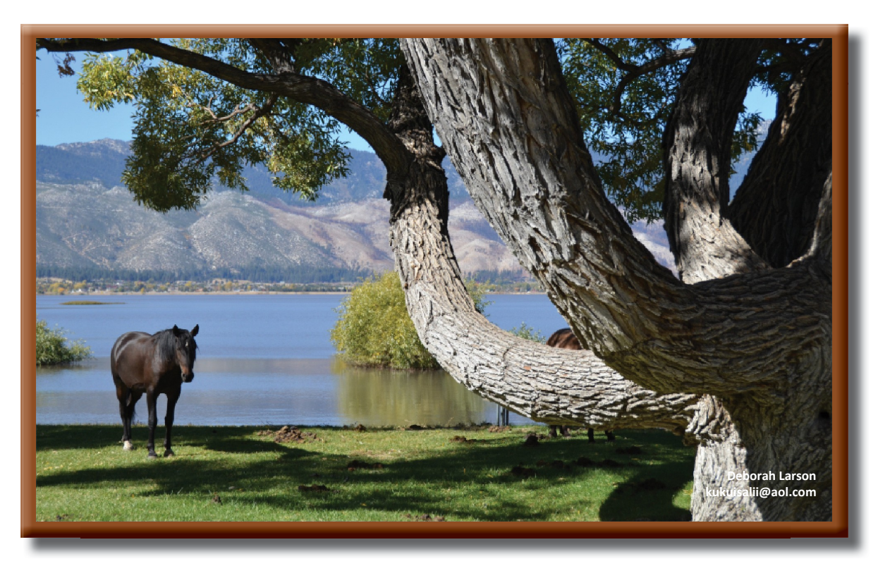
Washoe Lake is a favorite Grazing location on the East Side of the Virginia Range.